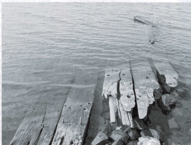
Parts of the wreck are visible at low-tide.

too unreliable for sailing on the Zuiderzee bay of the North Sea. The ship was used for fishing on both the Meuse and the Waal rivers for mainly salmon and eel, which required special techniques and equipment. Fishermen from Heerenwaarden were famous for fishing a long way upstream the Rhine, far into Germany. To maximize their profit, maintenance to their vessels and the wreck in question was limited to replacing rotten wooden parts with cement and ultimately cladding their outer surface with thin steel sheet. The unavoidable slow leakage became fatal for the vessel in question that had to be eventually abandoned and slowly sank in the river. In the following years, the vessel was vandalized leaving limited remains to be investigated during our project. The complete results of our project have been reported thoroughly and digital versions can be downloaded from our website at www.mergorinmosam.nl as well as the official site of the Dutch Association for Volunteers in Archaeology at www.awn-archeologie.nl . ♦